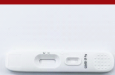
SARS-CoV-2 Antigen Test Cassette